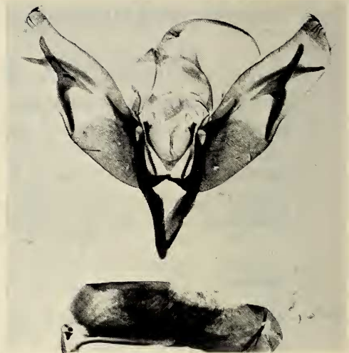
Fig. 2. Male genitalia of Dichagyris imperator (A. BANG-HAAS, 1912) Marocco mer. Tinerkir, 1350 m., 6.-8.V. 1973 leg. BENDER, coll. Zool. Staatssamml. München. Prep. HACKER N. 2087.